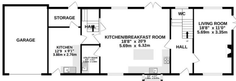
GROUND FLOOR 1212 sq.ft. (112.6 sq.m.) approx.