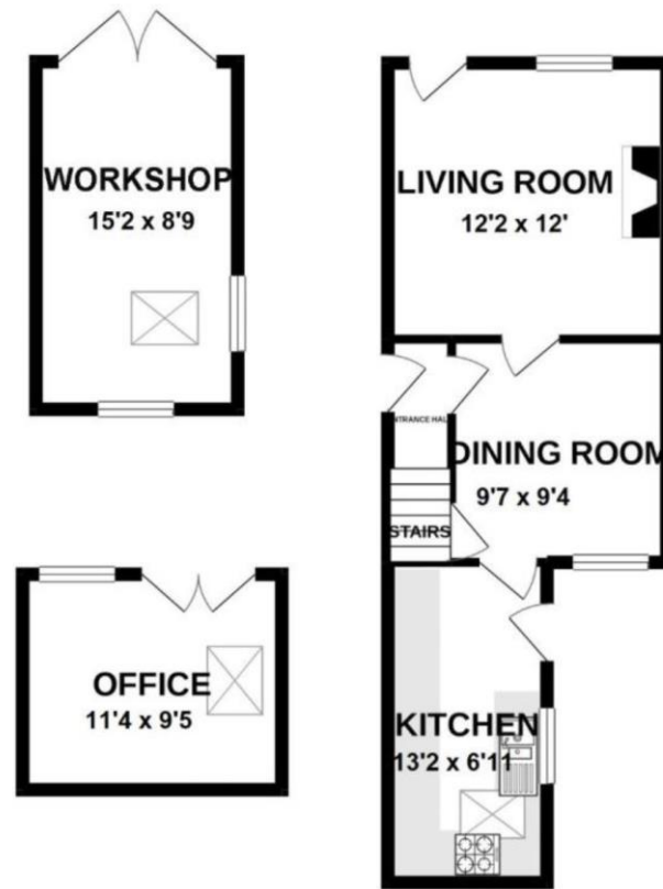
GROUND FLOOR 55.4 sq. m. (597 sq. ft.) approx.