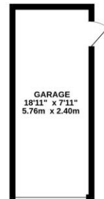
TOTAL FLOOR AREA: 1061 sq.ft. (98.6 sq.m.) approx.

Whilst every attempt has been made to ensure the accuracy of the floorplan contained here, measurements of doors, windows, rooms and any other items are approximate and no responsibility is taken for any error, omission or mis-statement. This plan is for illustrative purposes only and should be used as such by any prospective purchaser. The services, systems and appliances shown have not been tested and no guarantee as to their operability or efficiency can be given. Made with Metropix CS2024